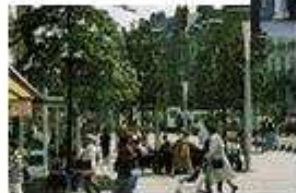
Cours des 50 otages